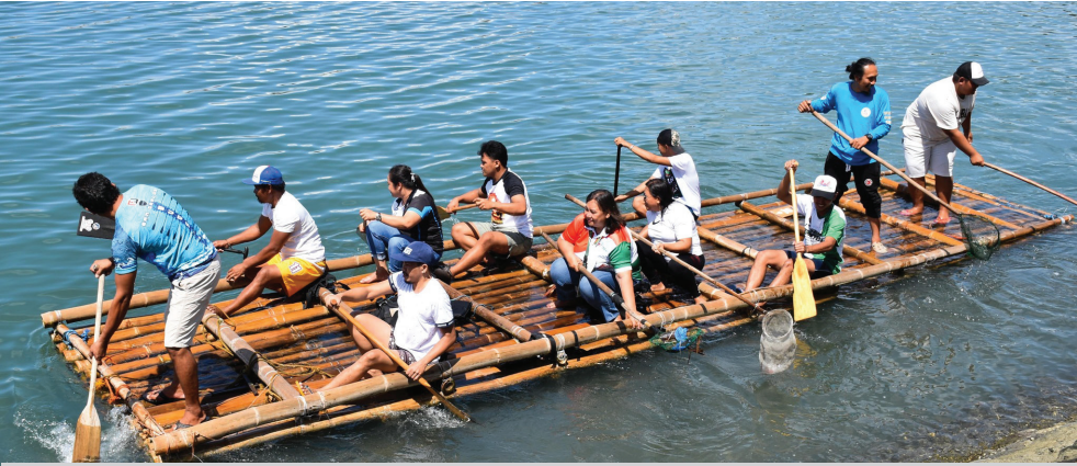
Members of Bugsay San Carlos joins the marine litter clean-up facilitated by City Env't Mgt. Office at Park Marina, Brgy. 3