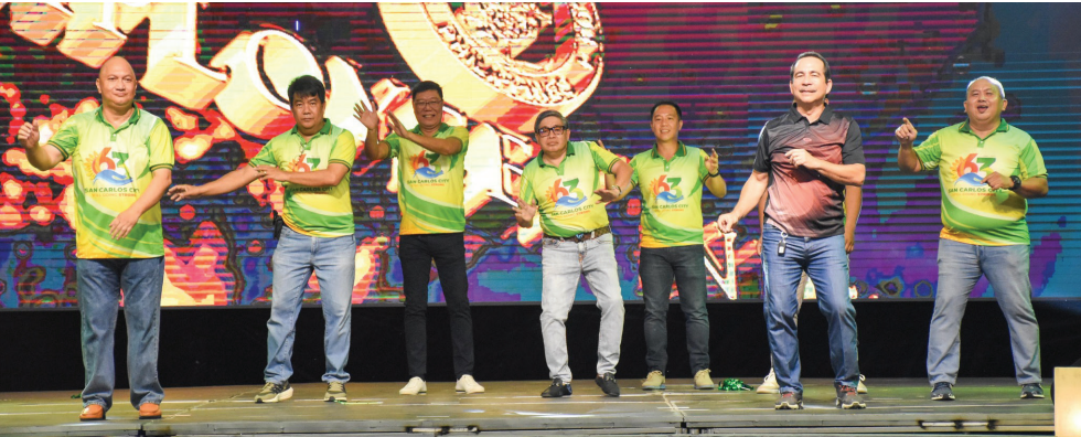
City officials dance to the beat during the Charter Day Anniversary LGU dance presentation held in front of the City Hall

The local government unit (LGU) of San Carlos City holds a gathering of government employees to welcome the city’s Charter Day Anniversary every July 1.