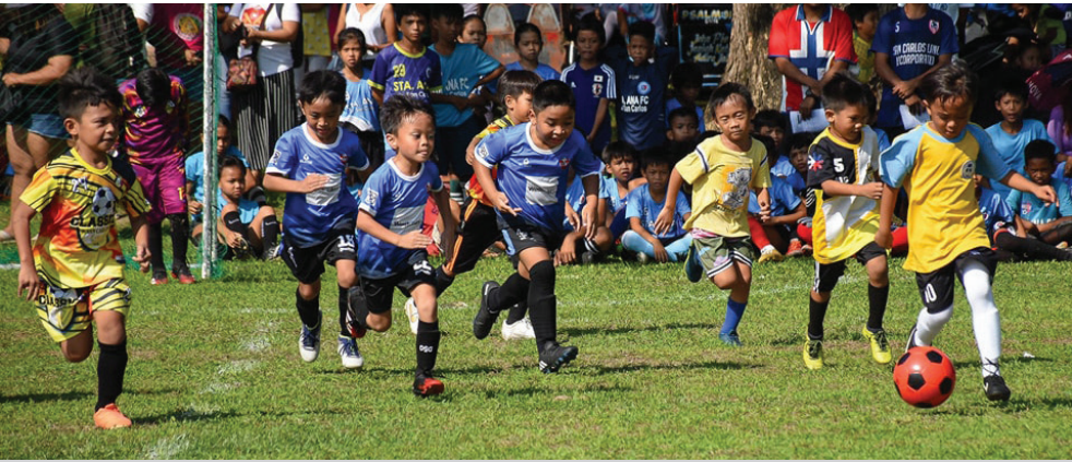
Football kids enjoys the football camp festival hosted by the city held at SJRI Field

The Manila-based RAYA Football Club and San Carlos City Negros Football Club held a one-day Summer Camp Football Festival at the Centermall Grounds on May 13, 2023.