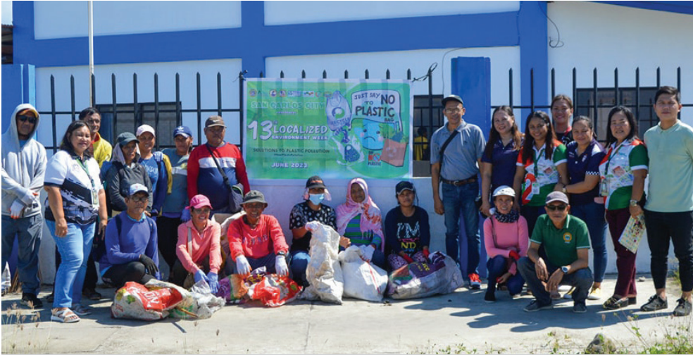
CEMO personnel led the clean-up activity at Brgy 6 in celebration of 13th Localized Environment Week, June 14

The City Environment Management Office (CEMO), led the various activities in celebration of the 13th Localized Environment Week in June 2023.