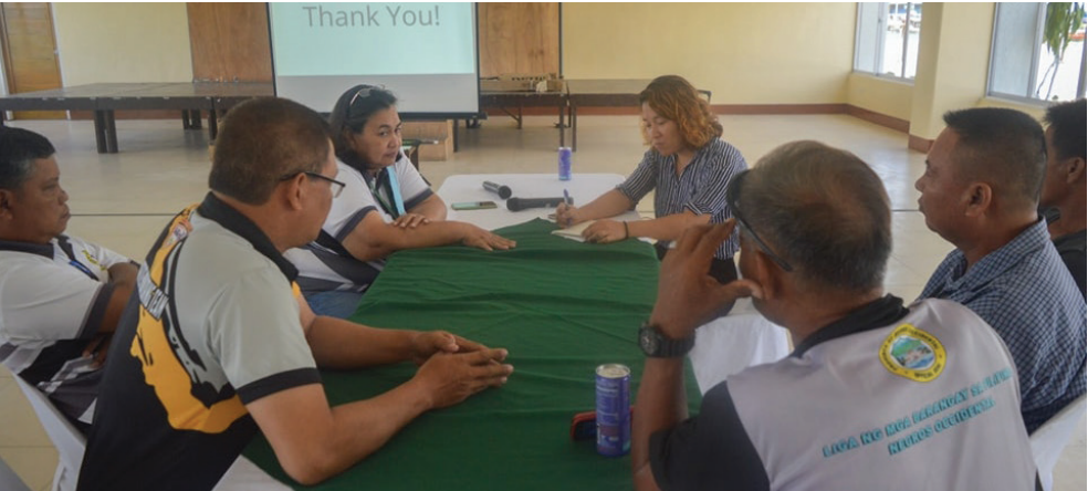
CEMO staff and local fisherfolks shares knowledge and information on the city's best practices and innovations on solid waste management at SCC Multipurpose Hall, Brgy 5

The local government of San Carlos City imparted its best practices and innovative approaches on Solid Waste Management (SWM) to the German Society for International Cooperation (GIZ) representatives last May 11, 2023, at SCC Multi-Purpose Hall, Park Marina.