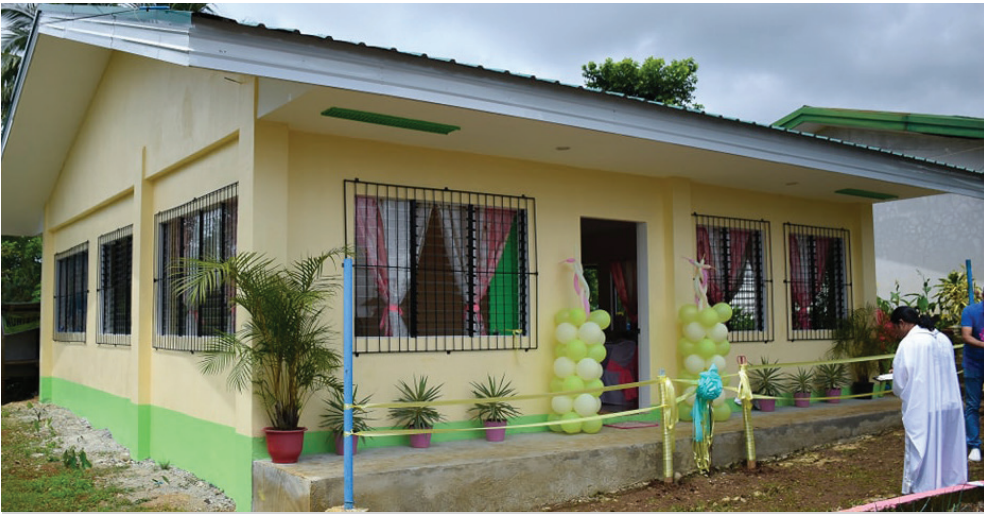
Newly-completed H.E. Building of Cabagtas ES, Brgy. Codcod