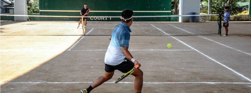
Tennis Tour NextGen Series Tournament held at San Carlos Tennis Center

Cebuana Lhuillier, in coordination with the local government unit (LGU) of San Carlos City thru San Carlos Tennis Association (SACATA), successfully held the Tennis Tour, NextGen Series on May 4-7, 2023, at San Carlos Tennis Center.