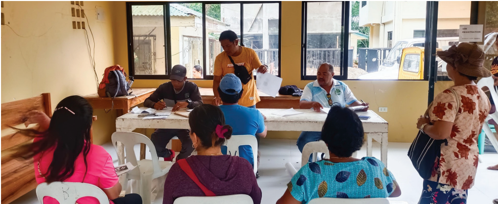
City Agriculturist Office staff facilitate the free registration of livestock mortality insurance to hog raisers at Brgy. Quezon

At least 48 hog raisers in So. Lupao and Proper Quezon, Brgy. Quezon availed of free livestock (swine) mortality insurance from Philippine Crop Insurance Corporation (PCIC) on May 12, 2023.