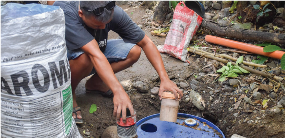
City Health Office personnel installed septic tanks to households in line with Zero Open Defecation Program of the city, Brgy. 1