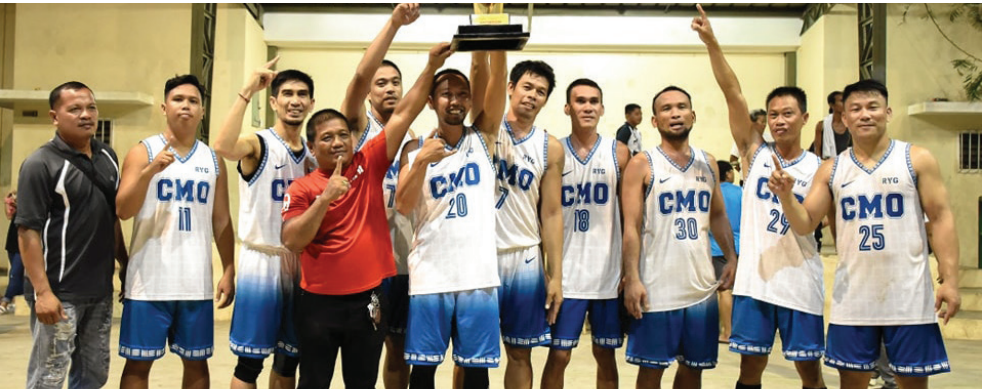
City Mayors Office Team wins the Mayor Rene Gustilo Cup 2023 Basketball Tournament

The City Mayor's Office (CMO) Team bagged the championship Mayor Rene Gustilo Cup 2023 Basketball Tournament finals last June 17, 2023, at Brgy. 3 Gym.