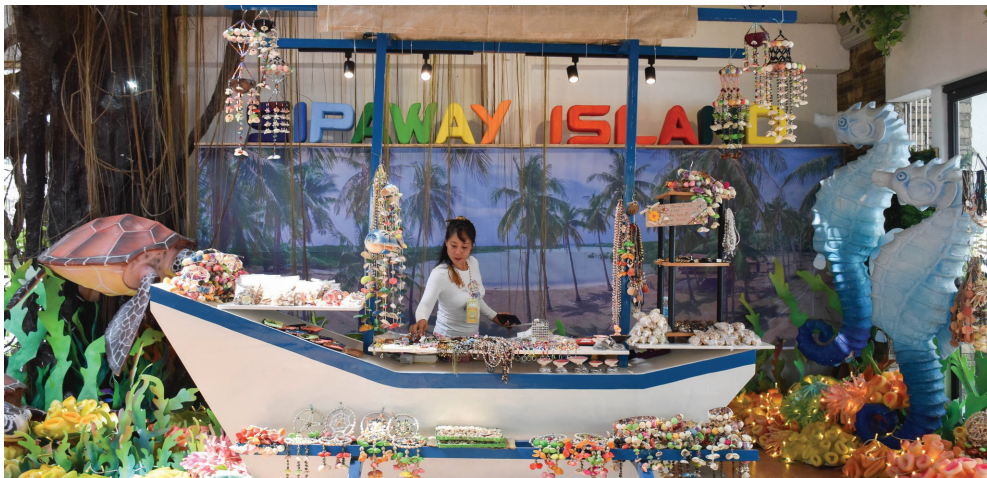
Inside the San Carlos City Booth at the Panaad Park featuring Sipaway Island