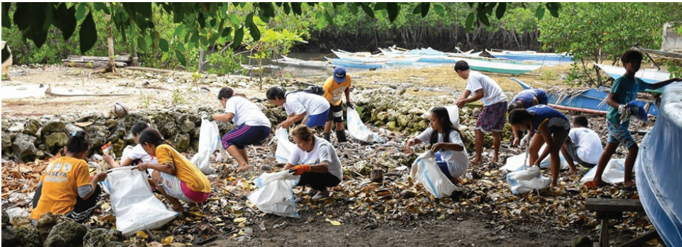
Local fisherfolks helped in coastal clean-up in celebration of Ocean's Month at Sipaway Island

The city government of San Carlos thru the City Environment Management Office (CEMO) celebrated the Month of the Ocean on May 20, 2023.