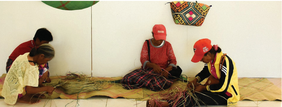
Indigenous People (IPs) community at So. Cabagtasan, Brgy. Codcod demonstrate their weaving skills during the National Heritage Month at People’s Park, Brgy. 3

San Carlos City through the Heritage, Culture and Arts Council celebrated National Heritage Month starting May 10, 2023 at People’s Park, Brgy. III.